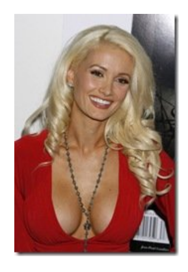
Way to go Criss!!